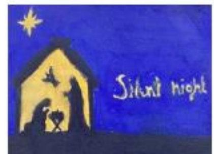
Evelyn White Key Stage 2