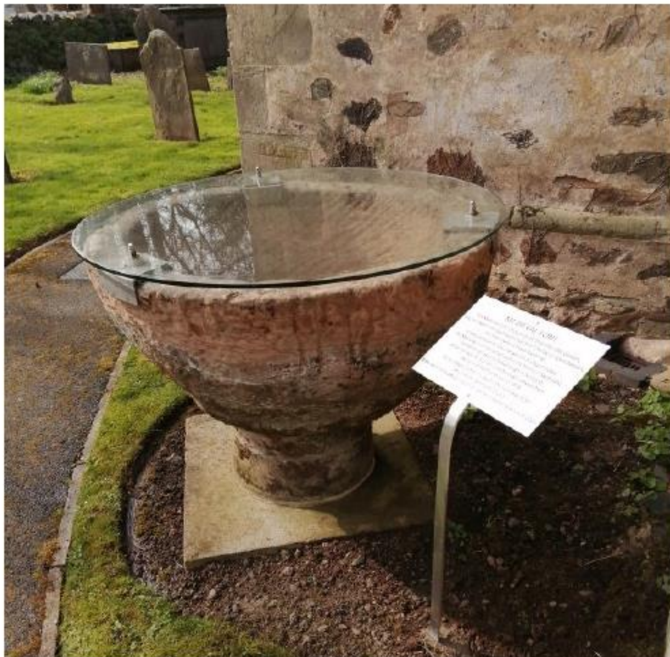
St Leonard's Church Medieval Font

With St Leonard's in Swithland in May 2022