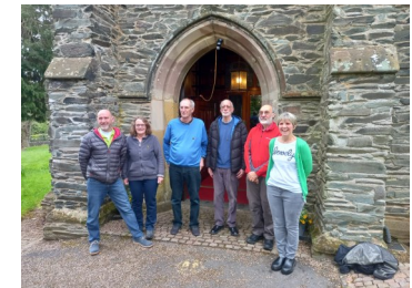
Ringers at St Paul's