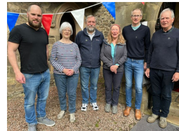
Ringers at St Mary's