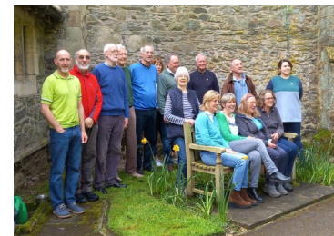
The ringing team, old and new members, at St Leonard's Church Swithland