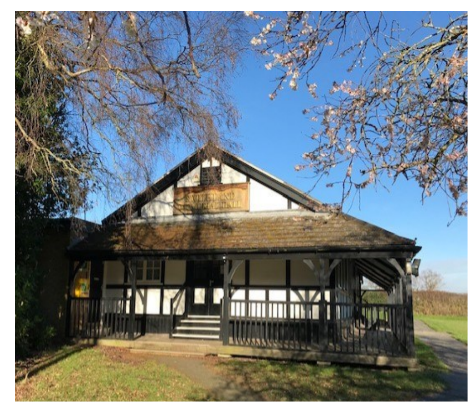
Swithland Memorial Hall